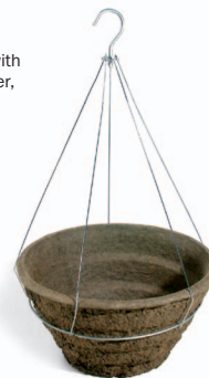
16X8 Garden Basket 20 ea./case 4.43 gal/16.8 l Un-Waxed