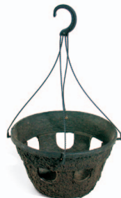
12 Cascade Basket 22 ea./case 2.34 gal/8.87 l