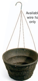
14XLRD Basket 20 ea./case 3.96 gal/15.0 l