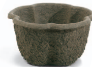
14 Clover 20 ea./case 3.77 gal/14.3 l