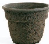
14 Bell Series 16 ea./case 5.28 gal/20.0 l