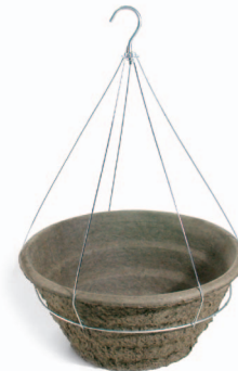
18X10 Garden Basket 20 ea./case 5.99 gal/22.7 l Un-Waxed