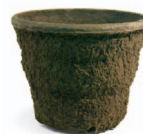
10 Traditional Series 16 ea./case 2.13 gal/8.07 l