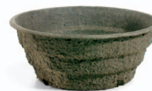
18X8RD 20 ea./case 5.65 gal/21.4 l