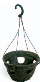
10 Cascade Basket 22 ea./case 1.37 gal/5.20 l