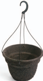
10XLRD Basket 22 ea./case 1.59 gal/6.05 l