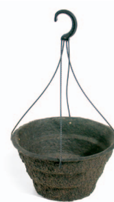
12RD Basket 22 ea./case 2.09 gal/7.93 l