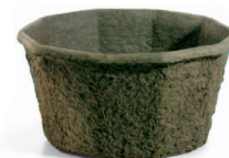
Dec-A-Pot 22 ea./case 3.93 gal/14.9 l