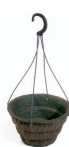
10RD Basket 22 ea./case 1.34 gal/5.10 l