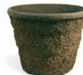
14 Traditional Series 16 ea./case 5.20 gal/19.7 l