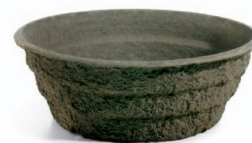
21X8RD 16 ea./case 7.21 gal/27.3 l