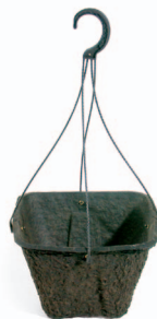
10SQ Basket 22 ea./case 1.84 gal/6.98 l

Sizes 10 through 14 are wax-permeated. For use with wire or Barbed Nylon Hangers, choose sizes 10 through 12 baskets with brass eyelets. 10 and 12 baskets also available without eyelets for use with Western's exclusive & easy-to-install Clip-on Nylon Hangers. All hangers sold separately.