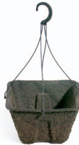
12SQ Basket 22 ea./case 2.80 gal/10.6 l