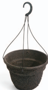
12XLRD-II Basket 22 ea./case 2.69 gal/10.2 l